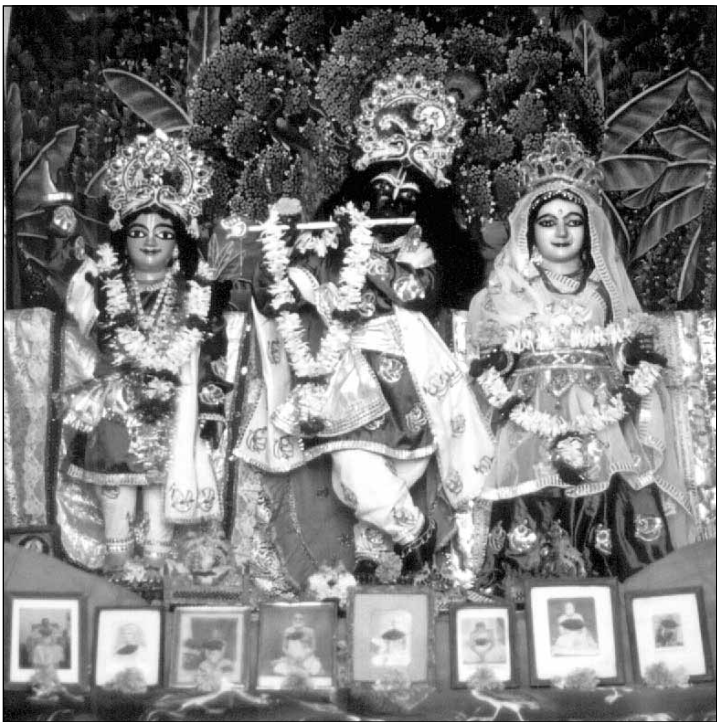
Śrī Śrī Guru-Gaurāṅga-Gāndharvā-Govindasundarjīu Nabadwip Śrī Chaitanya Sāraswat Maṭh